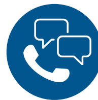
Our Adelaide-based Contact & Service Centre