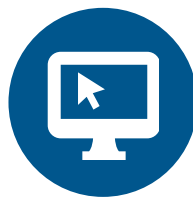
Self-service Member Portal