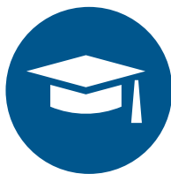
Member Education Seminars

The fees you pay help to cover the cost of providing many of the benefits you receive as an FRP investor. These benefits include: